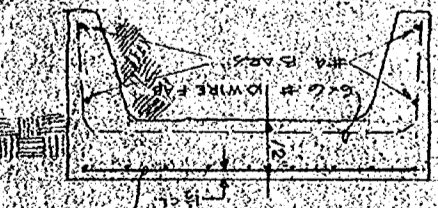
AC. PAD SECTION

AC. CONDENSOR OR CONC. PAD SEE HW. DWG'S AND DETAIL ON THIS SHEET